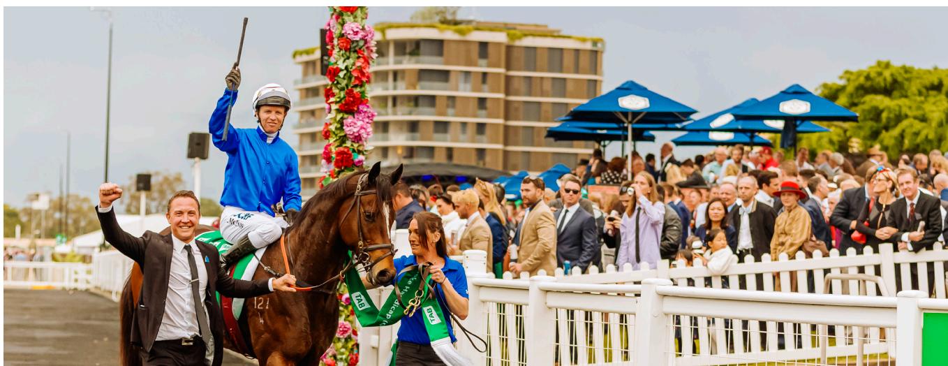
Trekking, TAB Stradbroke Handicap 2019 Winner