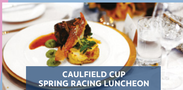
CAULFIELD CUP SPRING RACING LUNCHEON

SATURDAY 12 OCTOBER 2019 VICE REGAL ROOM, EAGLE FARM RACECOURSE