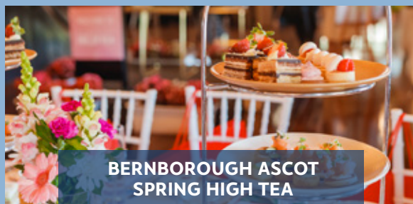
BERNBOROUGH ASCOT SPRING HIGH TEA

FRIDAY 11 OCTOBER 2019 THE TOTE ROOM, EAGLE FARM RACECOURSE