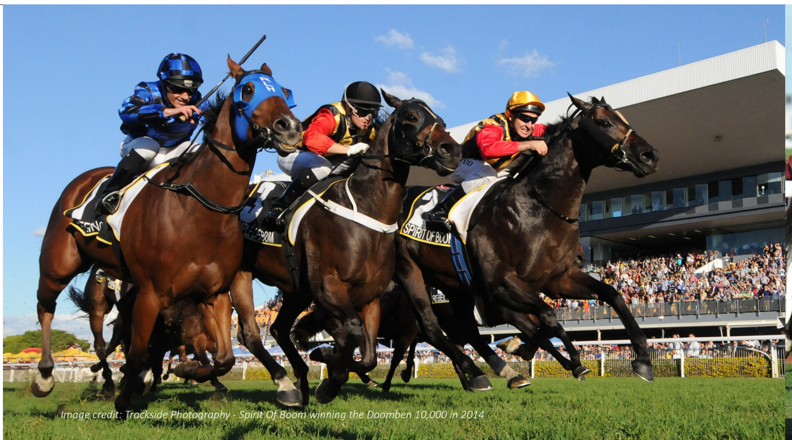
Spirit Of Boom winning the Doomben 10,000 in 2014