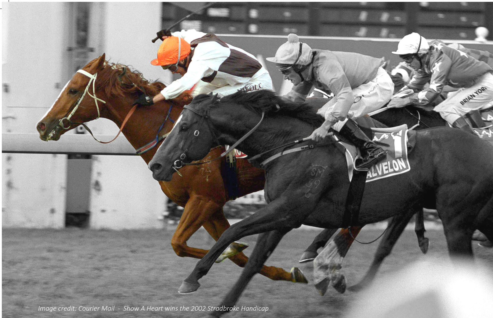
Show A Heart wins the 2002 Stradbroke Handicap