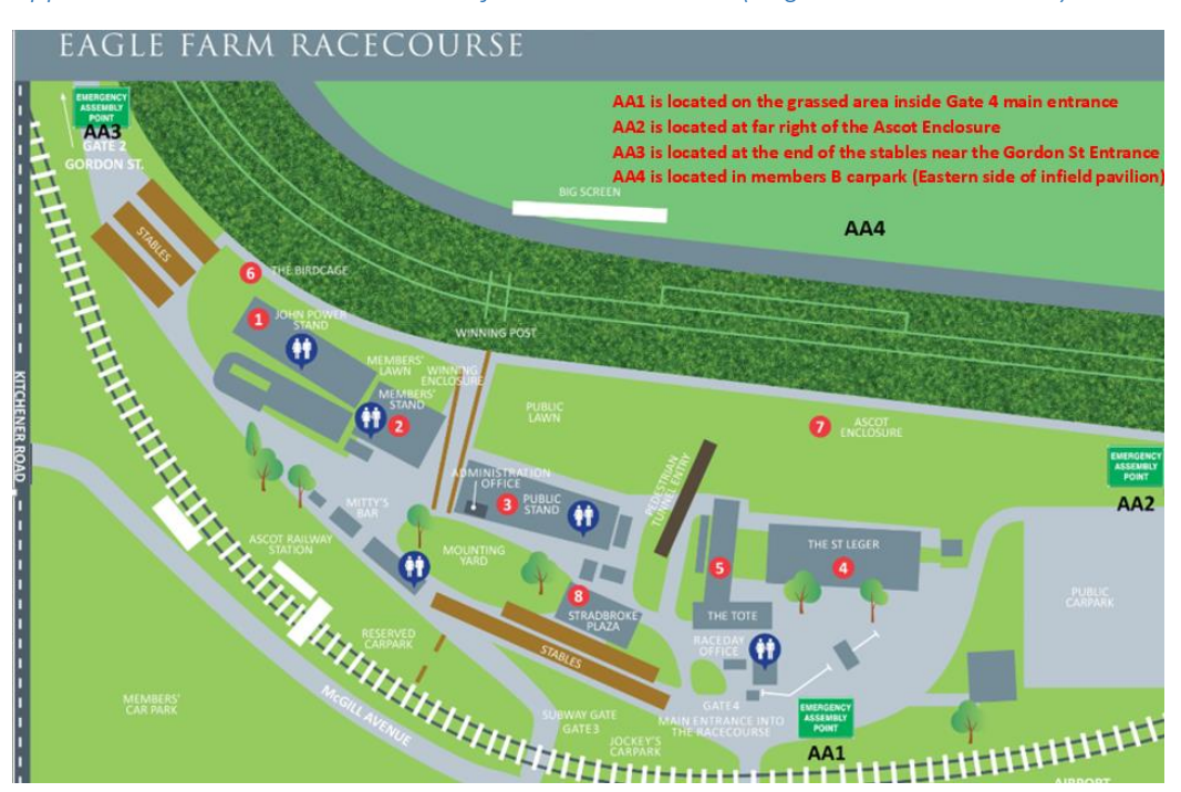
Appendix 1 - Automated External Defibrillator Locations (Eagle Farm & Doomben)