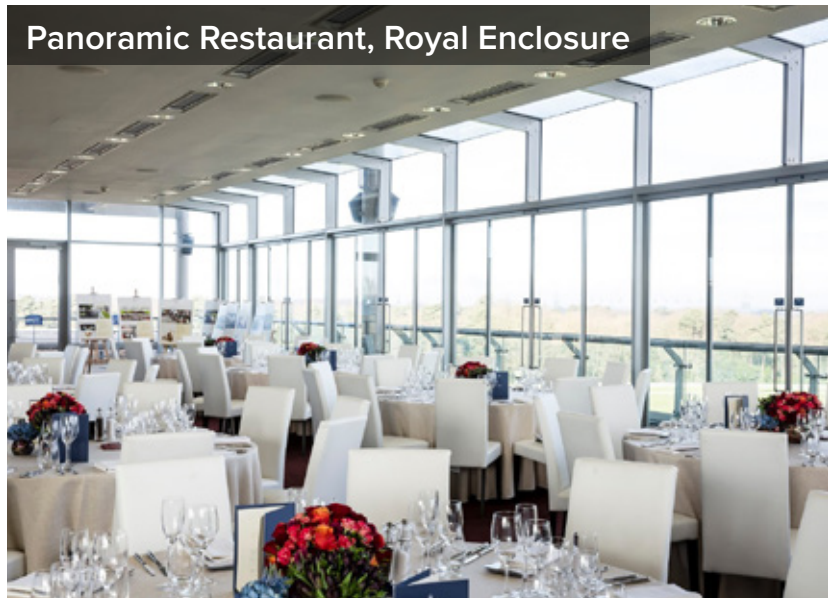
Panoramic Restaurant, Royal Enclosure

For further details and costings, please contact our office at your earliest convenience.