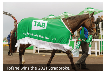
Tofane wins the 2021 Stradbroke.