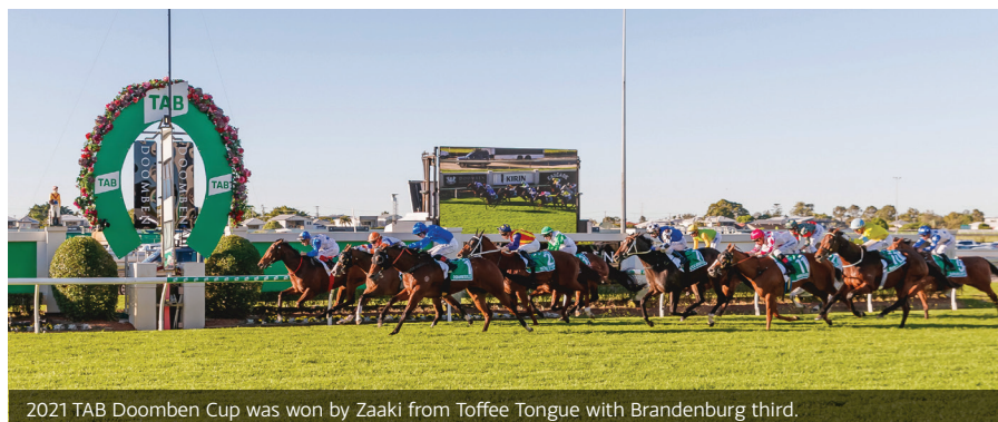
2021 TAB Doomben Cup was won by Zaaki from Toffee Tongue with Brandenburg third.